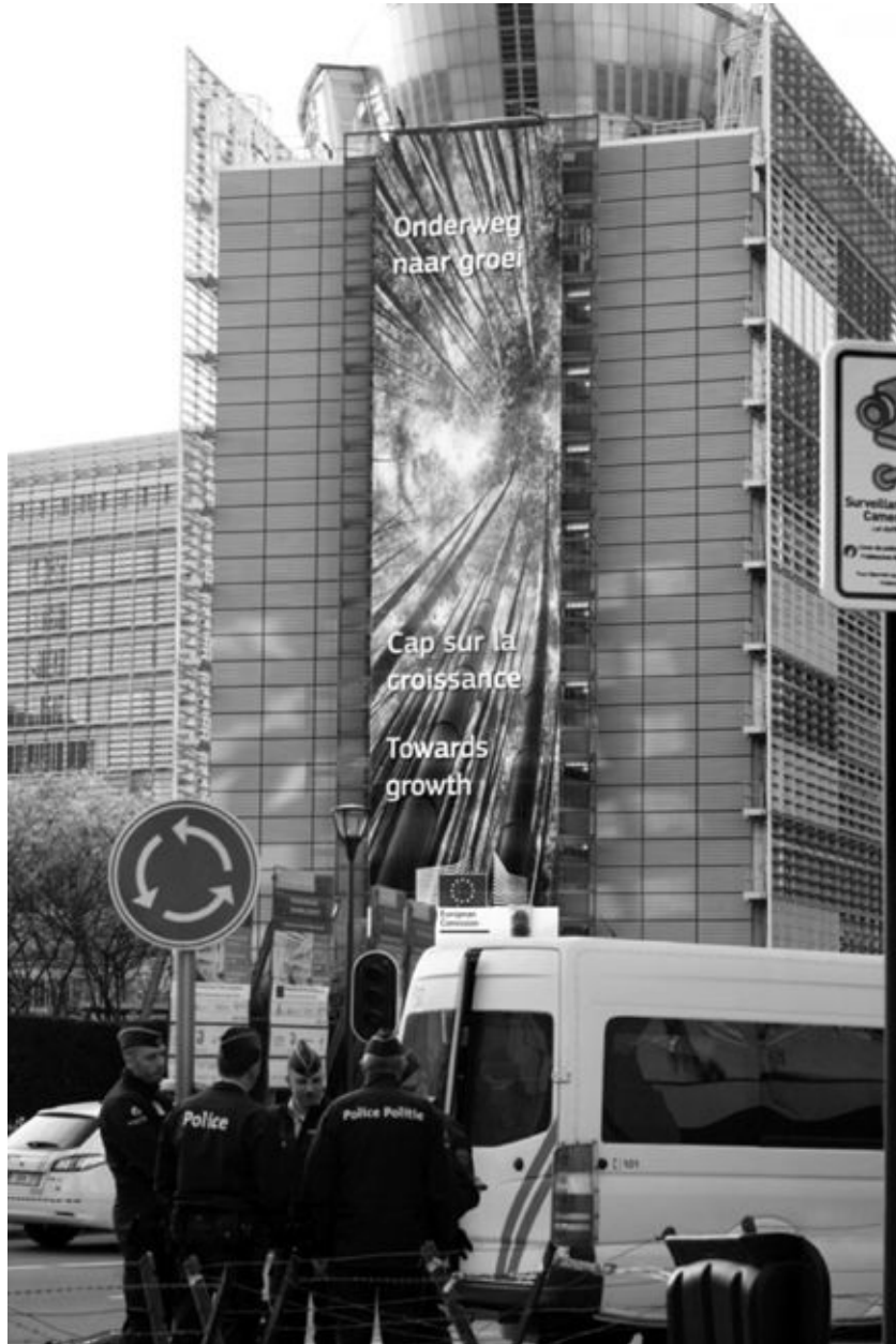
'Towards growth': the European Commission in Brussels. (Photo taken by Filka Sekulova at the Berlaymont Building, Headquarters of European Commission in Brussels, March 2014)