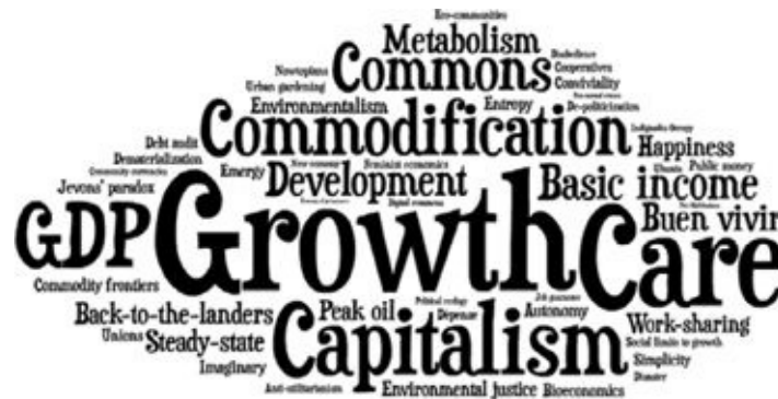
FIGURE 1 The keywords of degrowth (size illustrates frequency of appearance of an entry in other entries in this book)

Degrowth is not the same as negative GDP growth. Still, a reduction of GDP , as currently counted, is a likely outcome of actions promoted in the name of degrowth. A green, caring and communal economy is likely to secure the good life, but unlikely to increase gross domestic activity two or three per cent per year. Advocates of degrowth ask how the inevitable and desirable decrease of GDP can become socially sustainable, given that under capitalism , economies tend to either grow or collapse.